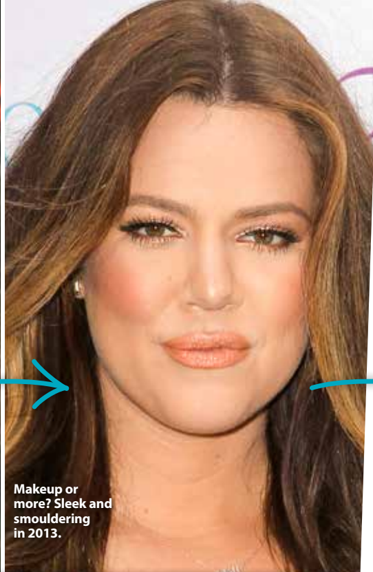
Makeup or more? Sleek and smouldering in 2013.