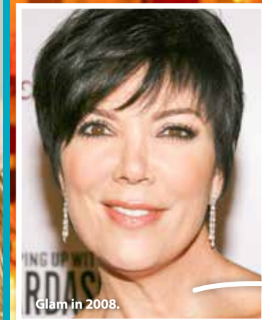
Glam in 2008.

Bruce (on Feb. 10) "thinks he looks great," says a source. "He doesn't listen to the criticism."