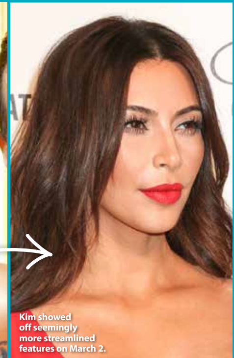
Kim showed off seemingly more streamlined features on March 2.