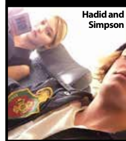
Hadid and Simpson

Since splitting last month, model Gigi Hadid and singer Cody Simpson have been avoiding each other. So imagine how awkward it was when the two were placed next to each other on a flight. "When you get seated next to ur ex on a plane," Simpson shared via Snapchat.